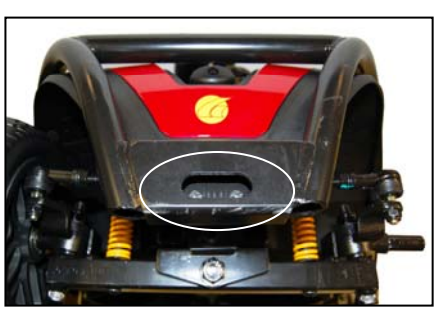
Figure 3: Nose-piece Screws