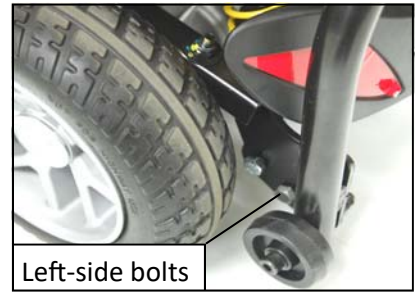
Figure 2: Rear Bumper Installed